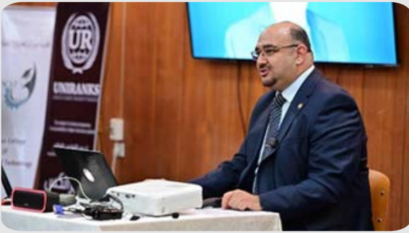
TVE institutes ranking workshop Ministry of Technical and Vocational Education (MoTVE) Surman, Libya

The Ministry of Technical and Vocational Education organized a workshop on 4 September 2023 on classifying Libyan technical and vocational education institutions. The workshop focused on systematizing the evaluation of technical and vocational education institutions according to international standards to map the progress achieved in the quality of services provided and compare them with each other and with higher education institutions in Libya, the Arab region, and the world as a whole. All technical colleges and technical higher institutes will go through a ranking system with UNIRANKS to modernize Libyan educational institutions.