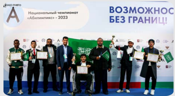
Vocational Excellence Championship for People with Disabilities (Abilympics 2023) Technical and Vocational Training Cooperation (TVTC), Saudi Arabia Moscow, Russia Federation

TVTC's trainees from various training facilities across Saudi Arabia participated in the Vocational Excellence Championship for People with Disabilities, which was held in the city of Moscow (Abilympics 2023), from 20 October to 22 October 2023. The trainees achieved success and distinction in the 'Passing the Skill within the Allotted Time' competition in the specializations of electricity, technical support and network management.